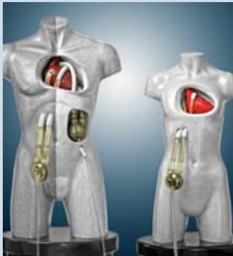
Heart assist device for adult patients (POLVAD) and a similar device for children (POLVAD-PED)

The devices built at the Artificial Heart Laboratory are part of the POLCAS heart assist system designed by the foundation. This includes not only building heart assist devices but also supporting their clinical application. The device's designers train medical personnel, run clinical projects to develop increasingly better treatment methods and effectively eliminate the risk linked to clotting within the devices. All this means continual development of treatment methods involving heart assist devices. As a result, heart assist devices are used today both as an aid in heart transplants and, increasingly often, as assistance in heart regeneration; that means they stay implanted in the patient for a long period of time. A few years ago, the