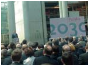
The report's launch at the Warsaw University Library in June