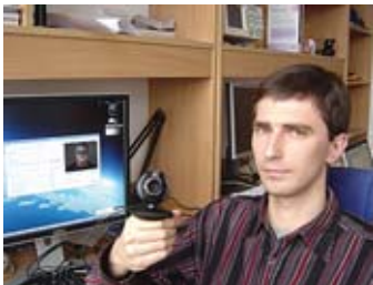
The Lip Mouse device uses a typical internet camera to analyze images of the user's head

important to be able to tell if children do not do well due to some problem or defect, or because they are not concentrated during a test and are looking somewhere else. The system will be five times cheaper than those available on the market today, the designers say.